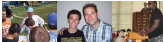
Rick Neuheisel UCLA Head Football Coach