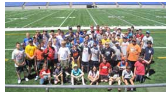
Step right onto the fields where the pros play: Sports Broadcasting Camp Baltimore.